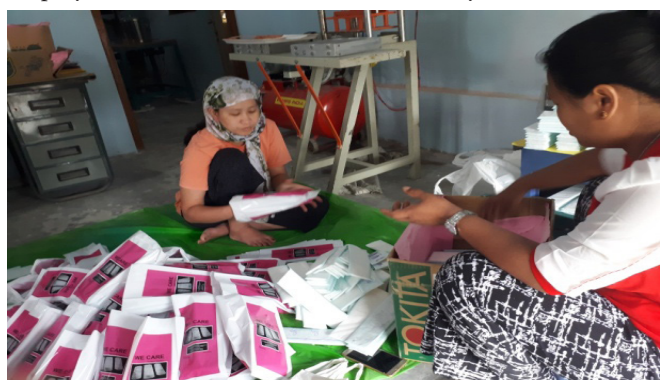
Sanitary Pads making unit

(b) Low cost sanitary pads making units promoted by NERCORMP III in Tirap district in Arunachal Pradesh is generating employment for at least 15 women directly, and another 120 women in the marketing of the pads. The sanitary pads have