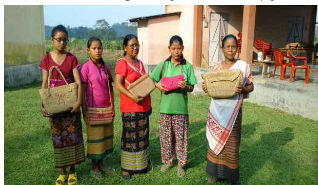
Water Hyacinth bags