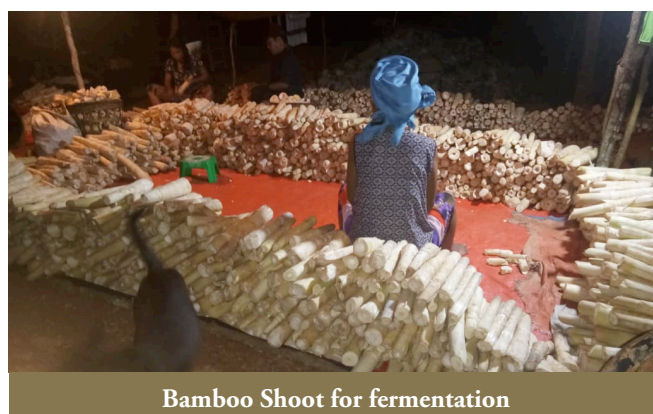
Bamboo Shoot for fermentation

Knowing the market demand and an opportunity for earning income, two women SHGs having 20 memberships each from H. Mongjang village in Chandel district in Manipur have started Income Generating Activities (IGA) on producing fermented bamboo shoot in large scale from the year 2017. Each member of the SHGs contribute about 160 kg of raw bamboo shoots during season. On an average, the group approximately produce 6400 kg (equal to 60 kg x 40 members) fermented bamboo shoot. The raw bamboo shoot of 160 kg is equal to fermented bamboo shoot of about 50-53 kg. At Rs. 50/kg, the group sold about 2133 kg of fermented shoots, earning about Rs. 1,06,650/-. The initiative has generated direct employment to 5 women of the SHG, while the other members are also given share out of the entire proceeds as their income. Indirectly, the activity provides benefits to about 30 other women who are engaged in retail selling of the product. The community science is the traditional knowledge of the women on the fermentation processes (which takes about 2 months) in addition to knowledge in making of fermentation baskets and methods/quantity of bamboo shoots harvesting from the bamboo clumps. The contribution of science and technology is in the packaging of the fermented shoots.