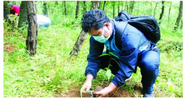
A staff of MLCU plants a sapling.

SHILLONG: With the objective to build a greener city, Martin Luther Christian University (MLCU) and Rotary Club of Orchid City Shillong (RCOCS) in collaboration with Meghalaya Integrated Mountain Development Initiative (MIMDI) and Rotaract Club of North-Eastern Hill University (NEHU), organised a tree plantation programme at Umsawli, Mawpat on Wednesday, and Lum Warkhylew, Umphyrmai on Thursday.