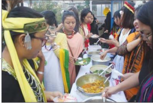
Students of Martin Luther Christian University during the indigenous food tasting event in Nongrah on Tuesday.

Tuesday at the MLCU main campus in Nongrah with a panel discussion on the topic 'Protect, preserve, promote the indigenous languages of the Northeast'.