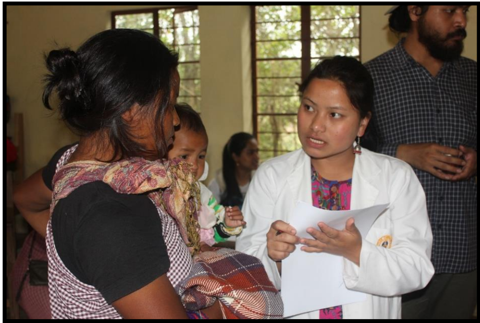
Health Camp at Umtong organised by the Department of Allied Health Sciences.