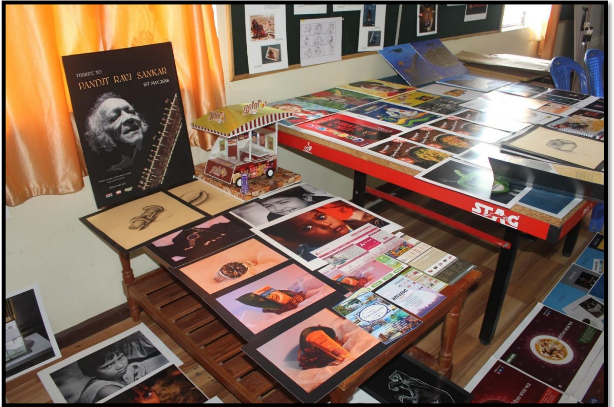
Art Exhibition organised in collaboration with Swar Sangam, Kolkatta