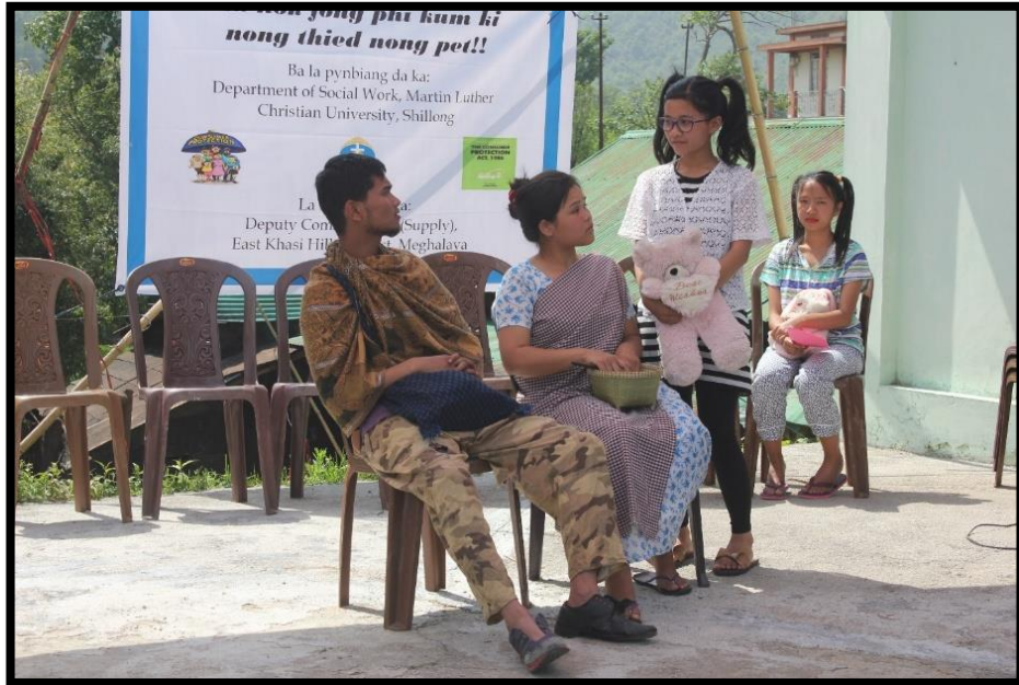
Consumer Rights Awareness Programme at Nongspung