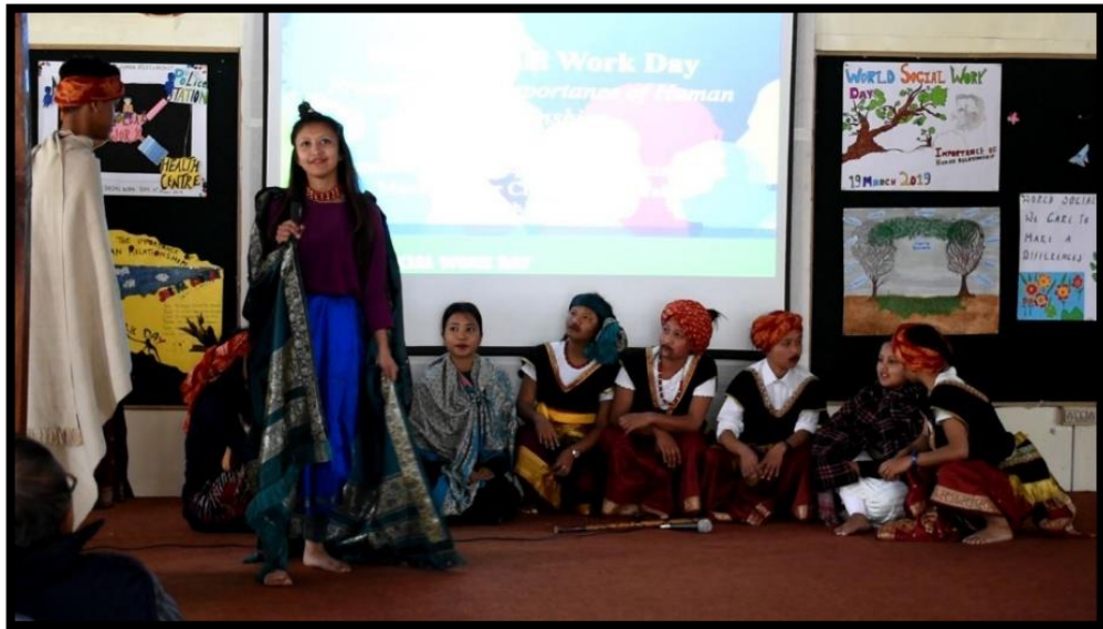
The Department of Social Work celebrating Social Work Day.