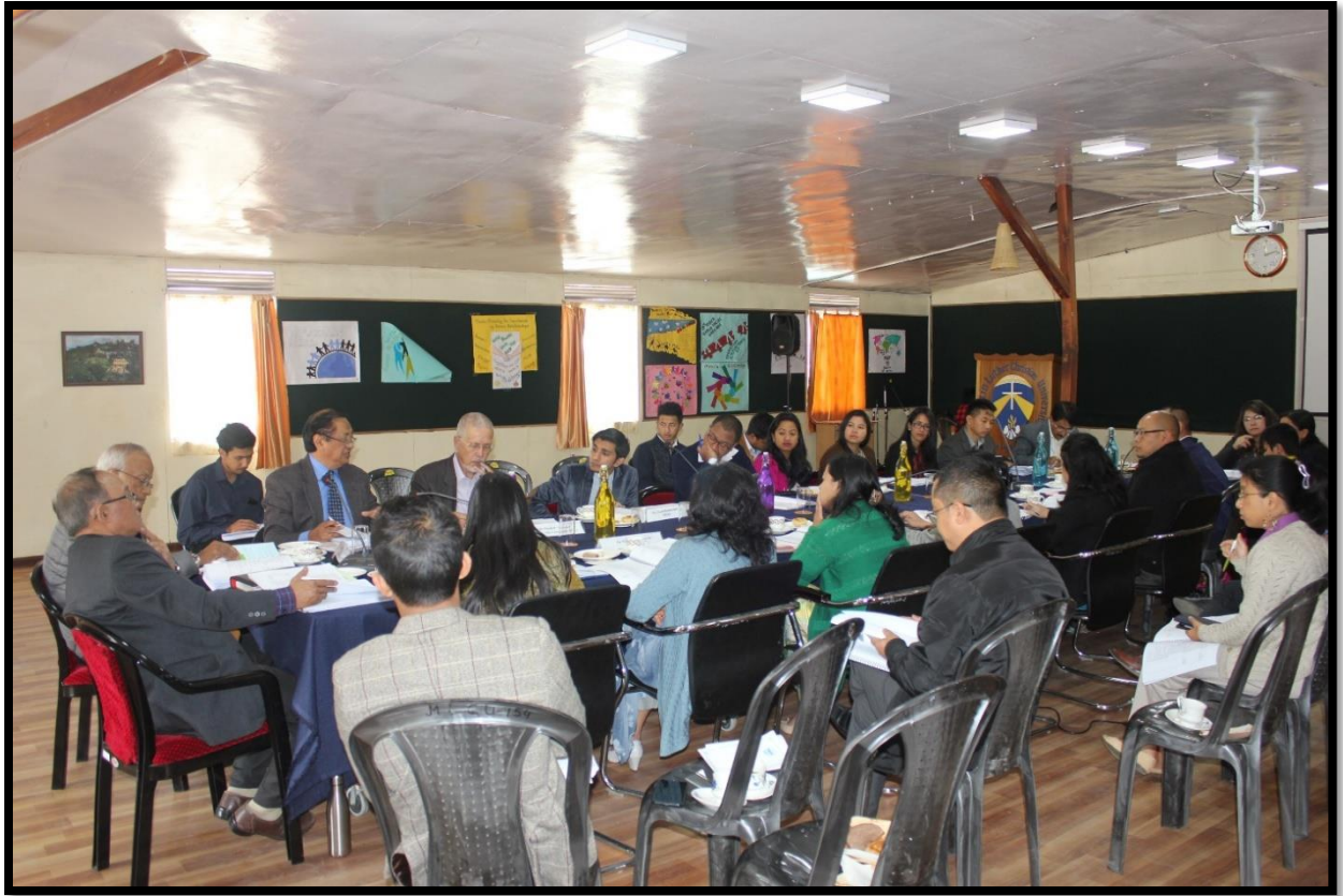
Academic Council held on the 20 th of March 2019.