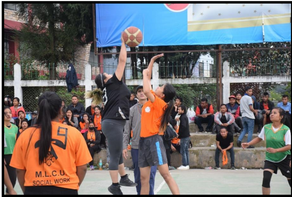
Students in action during Aurora 2018