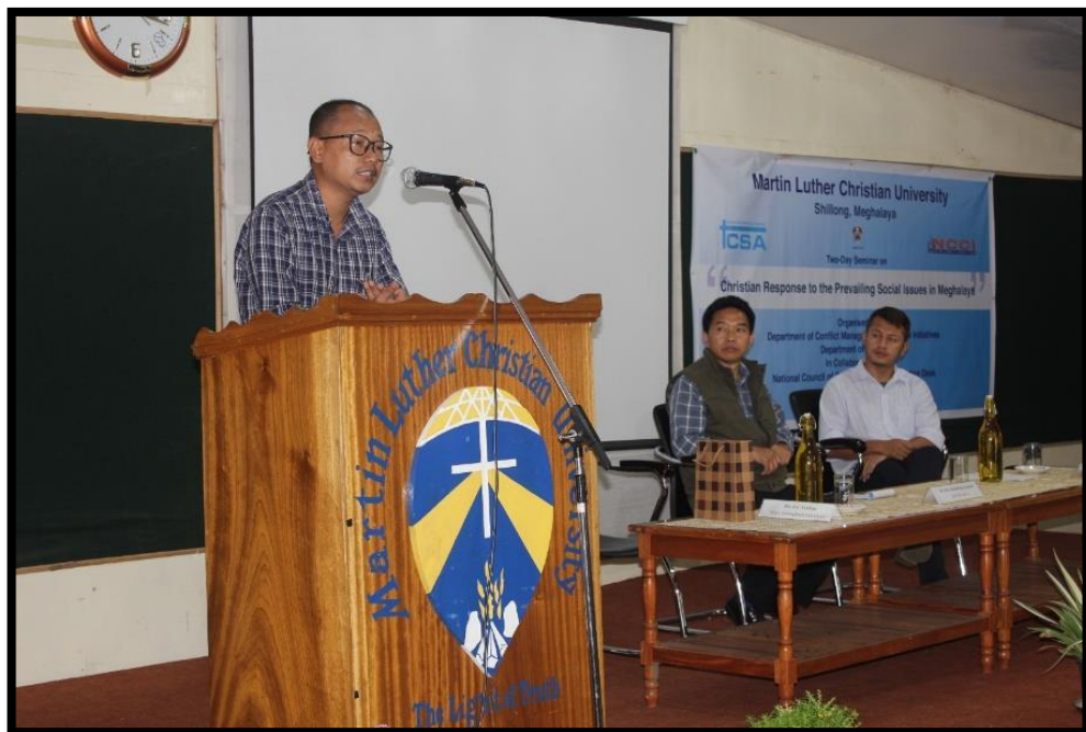
Seminar on "Christian response to prevailing Social Ills" organised jointly by the Department of Theology and Department of Conflict Management and Peace Initiatives.