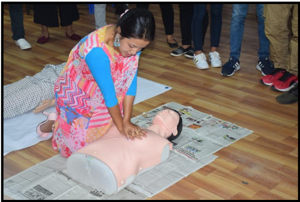
First Aid Workshop for students and faculty