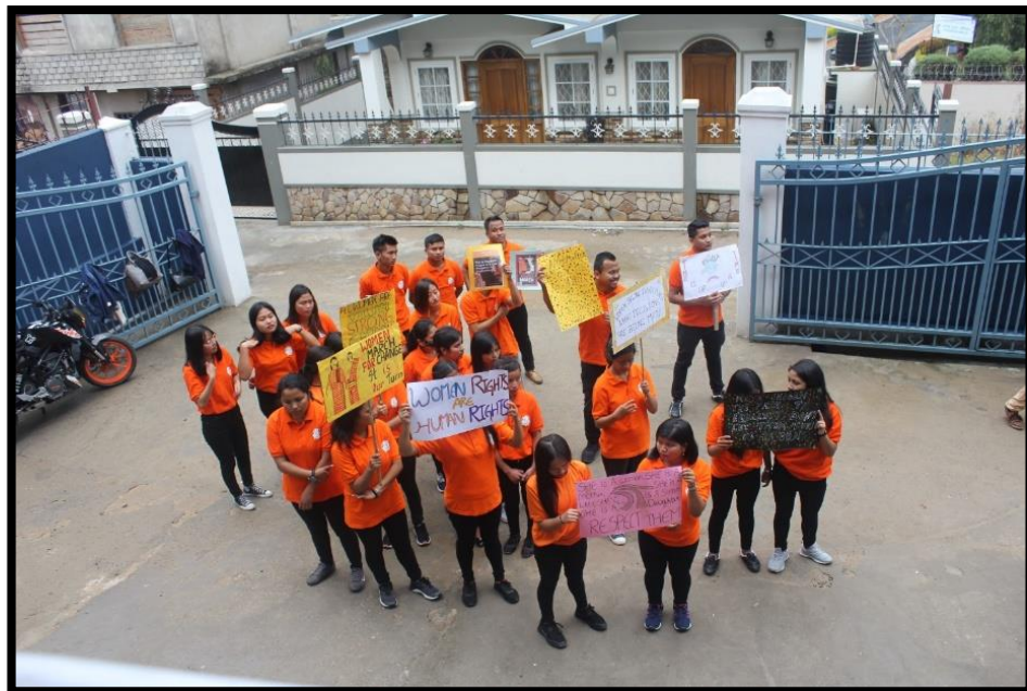
The Department of Social Work joining the rest of the nation in the 'March for Change.'