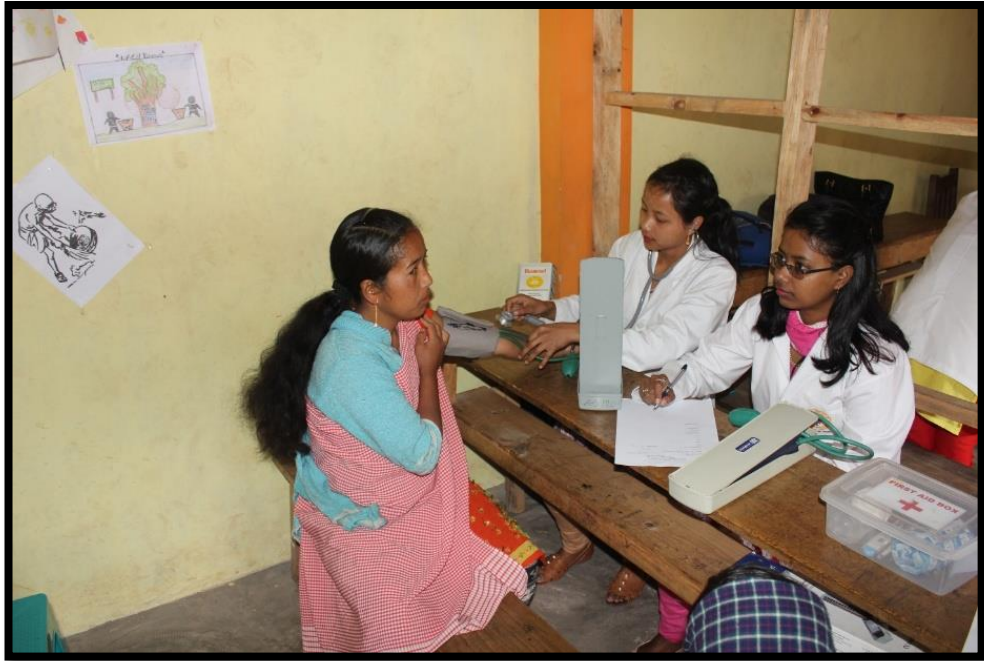
Health Camp at Mawliehpoh organised by the Department of Allied Health Sciences.