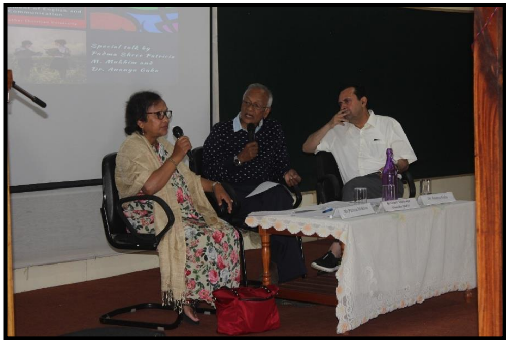
Panel Discussion during World Book Day Celebration