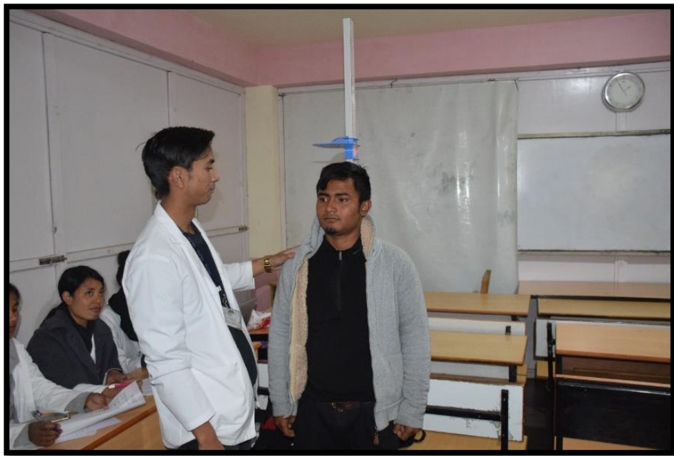
Health screening for the students of the University.