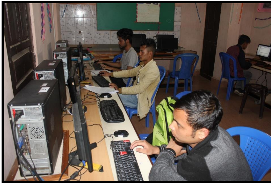
Students participating in an activity as part of Department of Computer Science's celebration of 'Metanoia 2019'