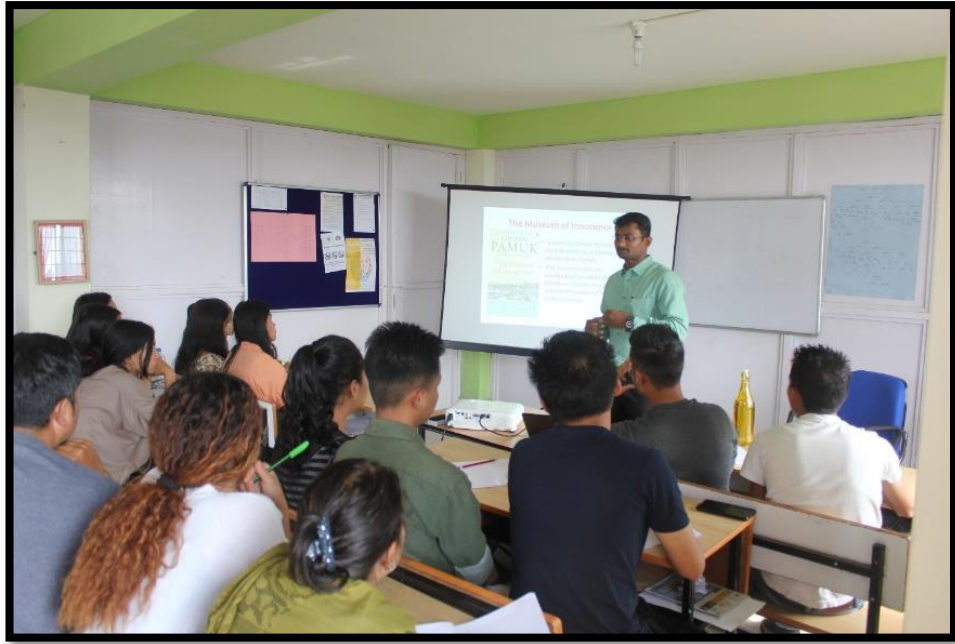
Department of English and Communication's interactive session.