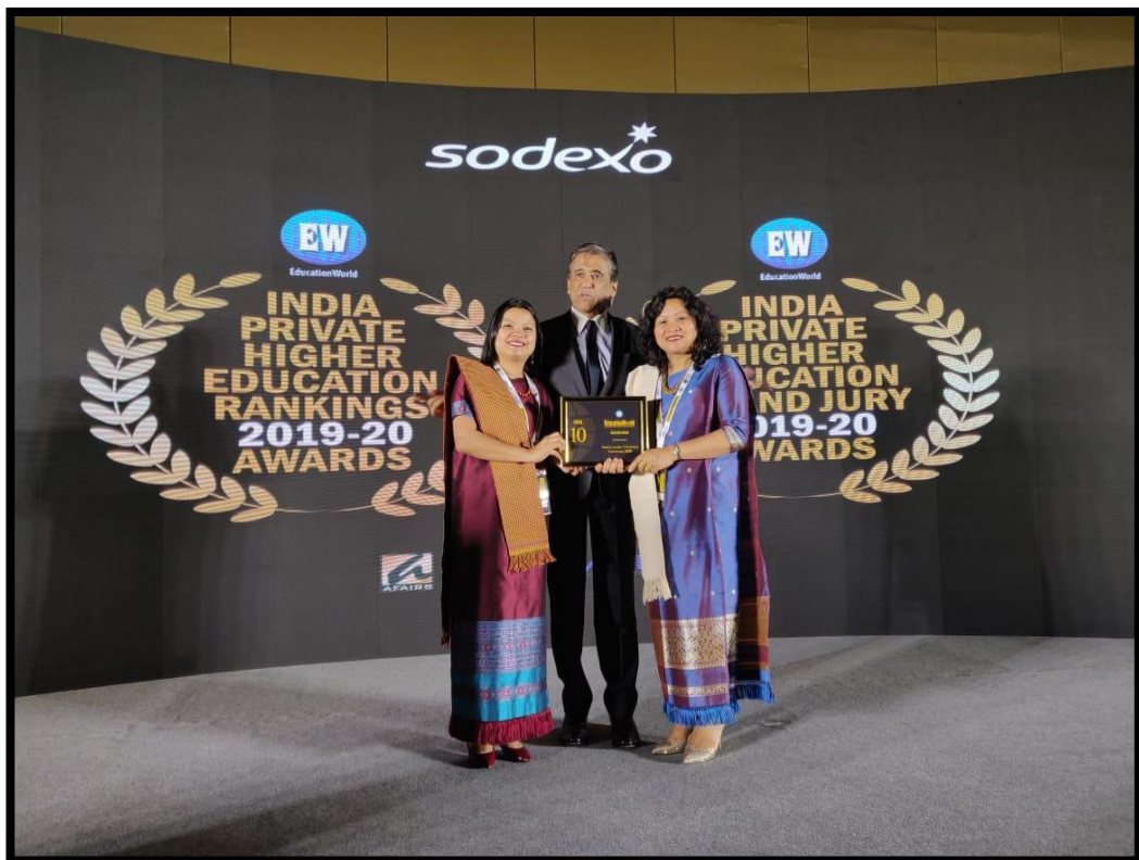
The Registrar and Dean Academics, MLCU receiving the award from Education World