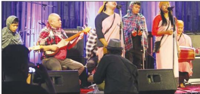
Students of Martin Luther Christian University perform at the Dorbar Hall, Mission Compound on Friday.