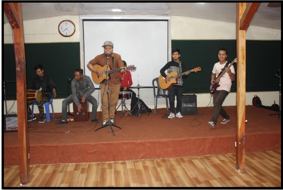
One of the many musical performances by the students of the Department of Music.