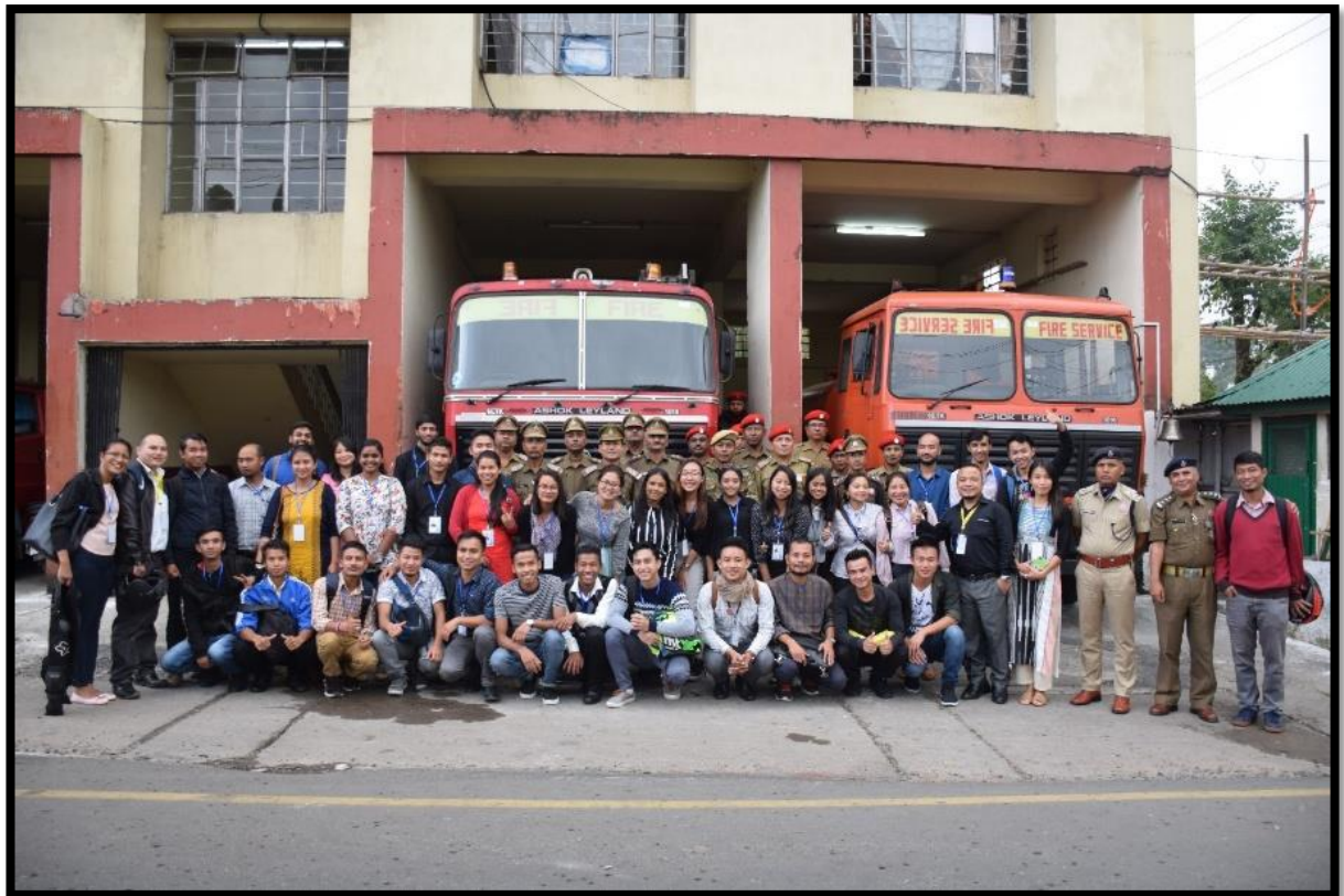
Special programme with firefighters as part of Aurora 2018