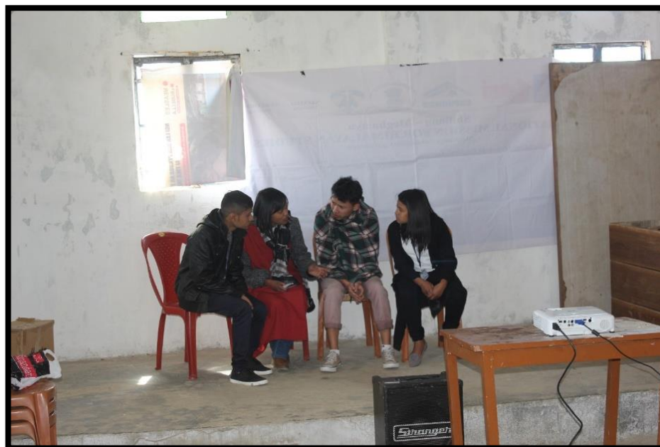
Awareness programme organised by the Department of Environment and Traditional Ecosystems at Mawkhma.