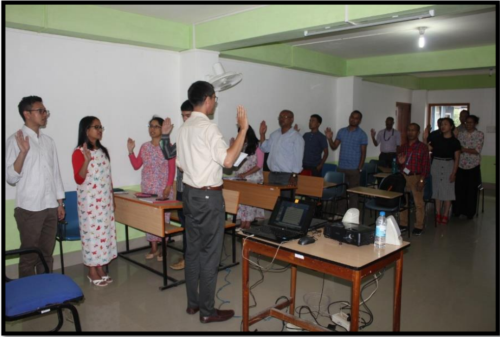
Observance of World No Tobacco Day organised by NSS, MLCU.